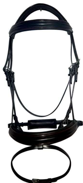
Trense New Trend braun