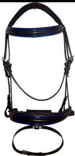
Trense New Trend blau