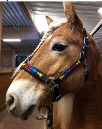
Leather Halter Cohokia