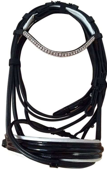
Trense Malibu weiß