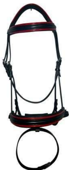
Trense New Trend rot