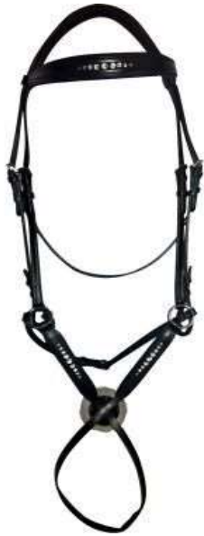
Trense La Condamine