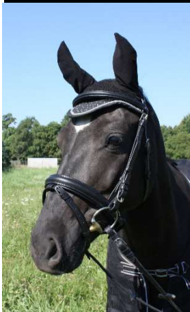
Trense Basic (second choice)