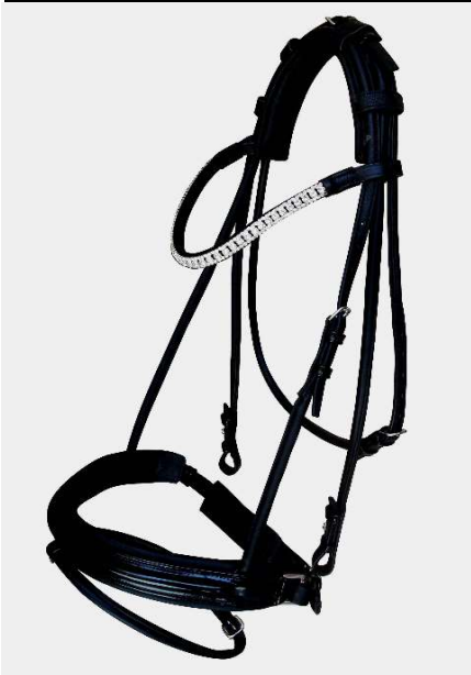
Bridle Malibu black