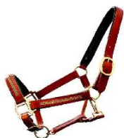
Leather Halter Girona