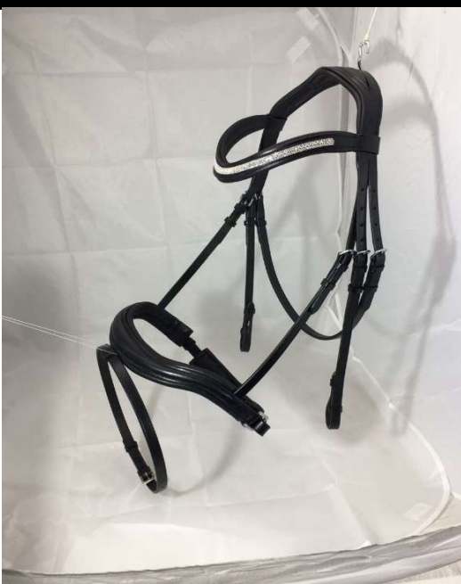
Trense Monte Carlo black