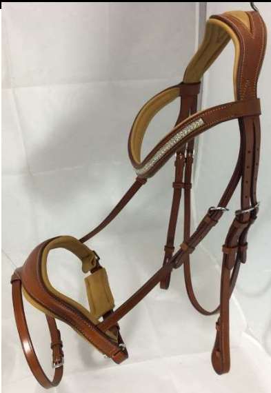
Trense Monte Carlo brown